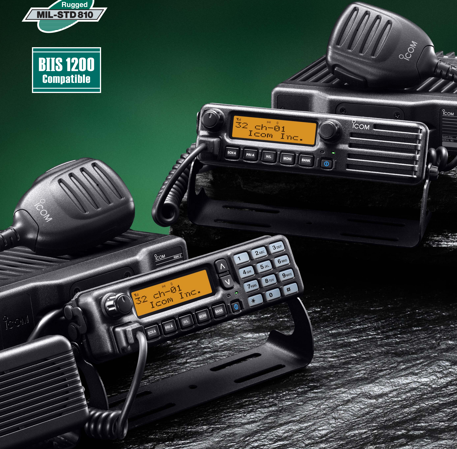
Photo includes optional separation kit, RMK-2 and separation cable, OPC-609.